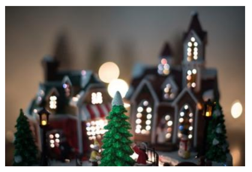
Capitan Country Christmas Bazaar

To learn more, visit allamericancowboyfest.com