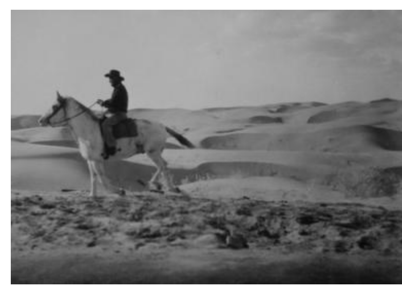
All American Cowboy Fest

Annual rodeo benefitting the Lincoln County Cowboy Crisis Fund, held at the Lincoln County Fairgrounds in Capitan.